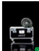
Silent Storm(ss) ®