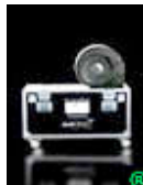
Silent Storm(t) ®