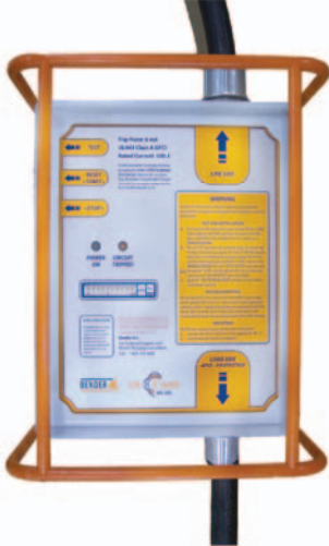
Portable LifeGuard 100